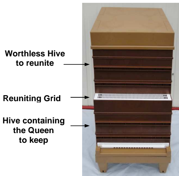
Off period of nectar flow

After 5 to 8 days, collect the body of the bad hive to dismantle it, shake the remaining bees behind the hives, and check that the bad queen is not on the reuniting grid because in this case, you must kill it. Then, remove the reuniting grid.